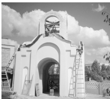
Russian Orthodox Bell Tower being built in Gatava.

I didn't write this to leave you with a bad report. My heart says more than ever that first we need to find repentance in our own homes. The Body needs to be re-fired, recommitted, rededicated and restored to the place of authority and power. We are a weak reflection of the Lord. We as the bride of Messiah need to be spotless and without wrinkle. We need to be submitted and directed by Yeshua/Jesus as our groom. He has set up the kingdom and we need to follow his plan.